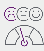
Patient frustration and mistrust