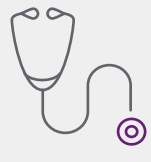
Misdiagnosis and treatment delays

Mistaken identities and unmatched records can have serious consequences, accounting for 70% of adverse outcomes . 1