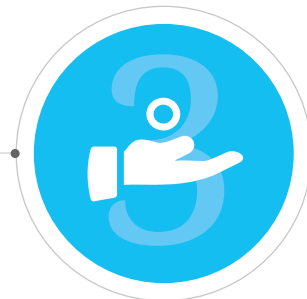
Facilitating Social Determinants of Health Analysis