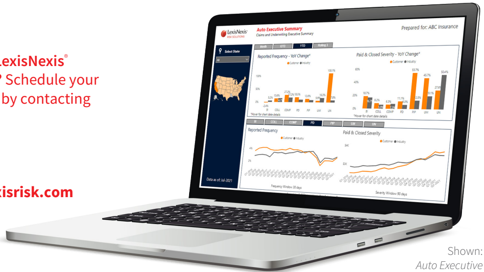
Shown: Auto Executive Summary Dashboard

Or contact us at 800.458.9197 insurance.sales@lexisnexisrisk.com